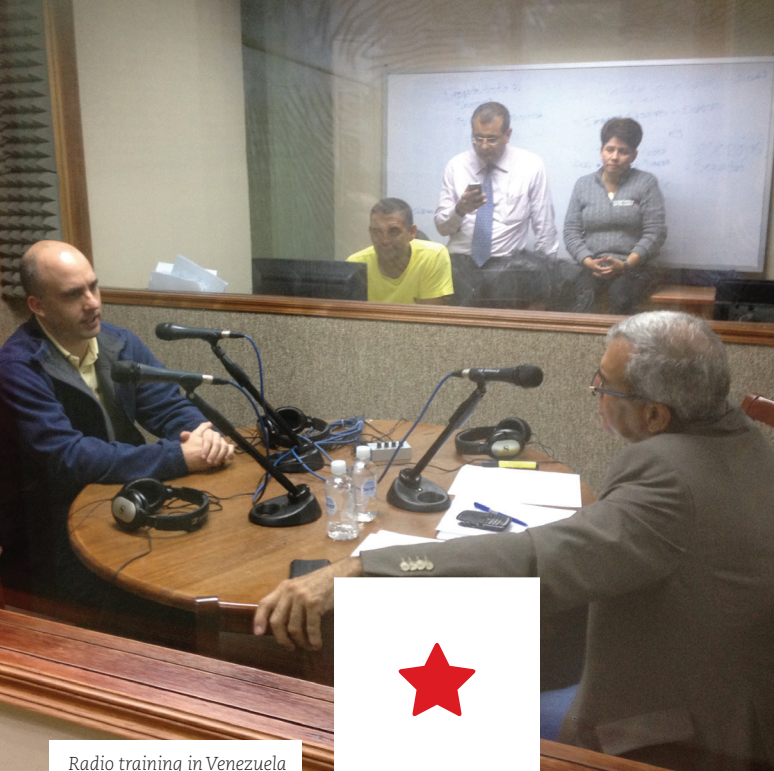
Radio training in Venezuela