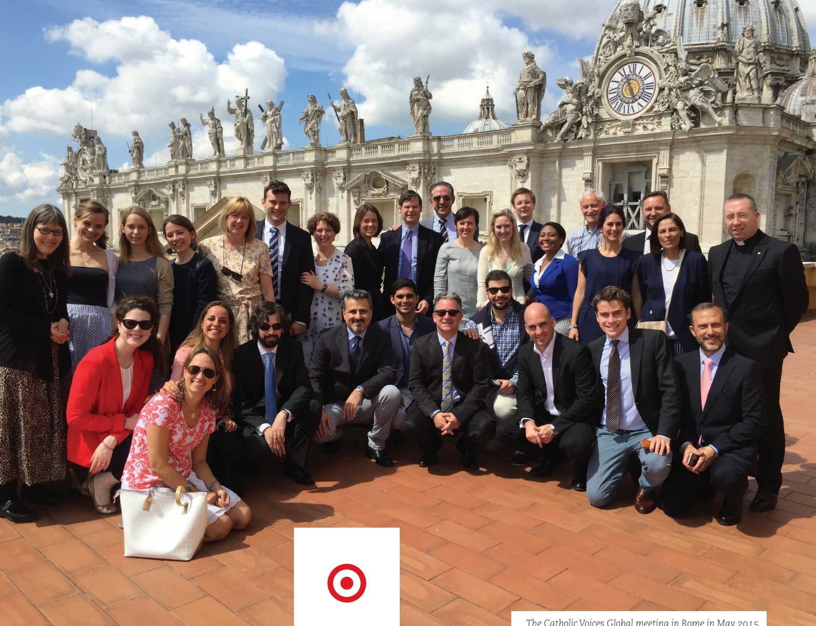
The Catholic Voices Global meeting in Rome in May 2015 brought together people from 20 countries