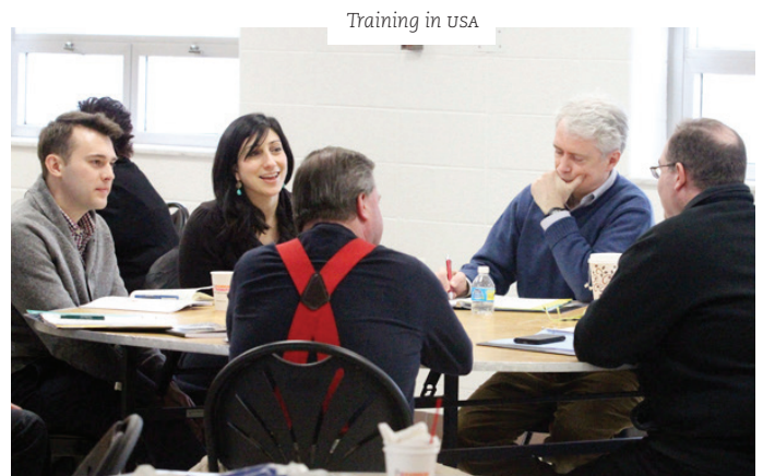
Training in USA