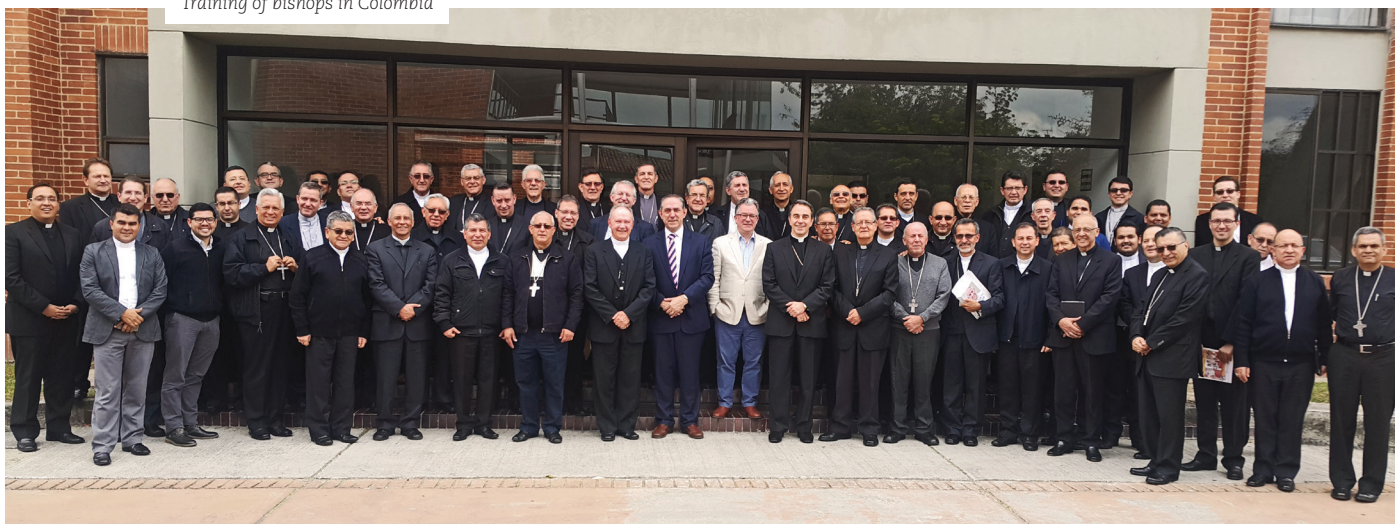
Training of bishops in Colombia

Through the Catholic Voices Academy, we offer regular briefings to both journalists and speakers on topics in the news or forthcoming events such as papal trips. CV in Mexico organized day-long seminars for journalists in advance of the trips by Pope Benedict in 2012 and Pope Francis in 2016. We also host public lectures on major topics by visiting speakers.