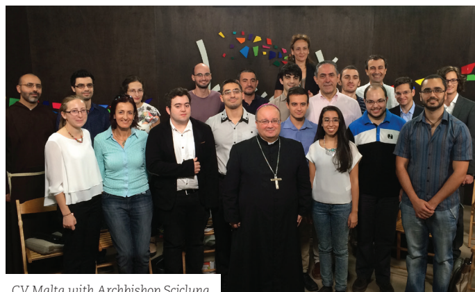
CV Malta with Archbishop Scicluna