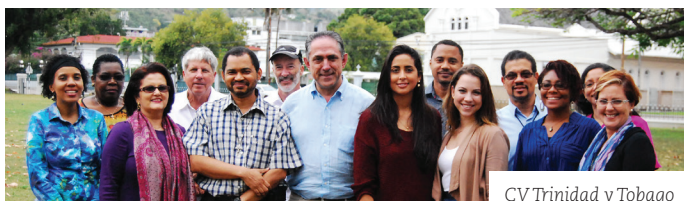
CV Trinidad y Tobago