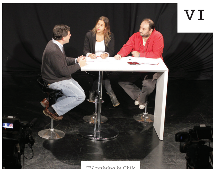
TV training in Chile

Our CVcomment.org blog has become a go-to source for authoritative comment on breaking news stories, especially those related to the Vatican and Pope Francis. More than 6,000 people receive email updates every time we post, equipping Catholics with background information and talking points on breaking news stories.