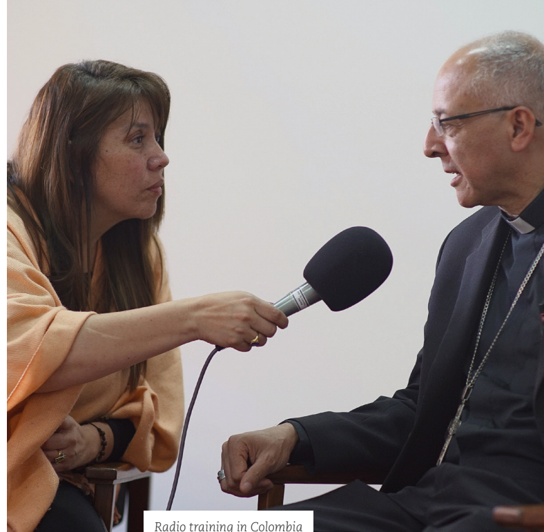
Radio training in Colombia