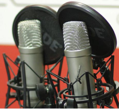
TV in Bolivia