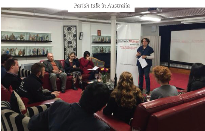
Parish talk in Australia