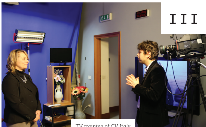
TV training of CV Italy